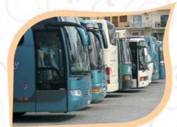
24 hrs Govt. Bus Facility