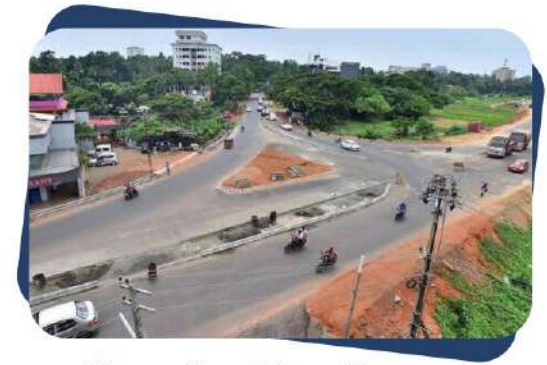
Near by Vandhavasi