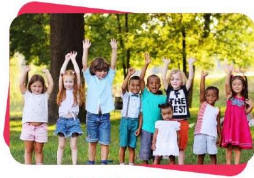
A Safe Haven for Children