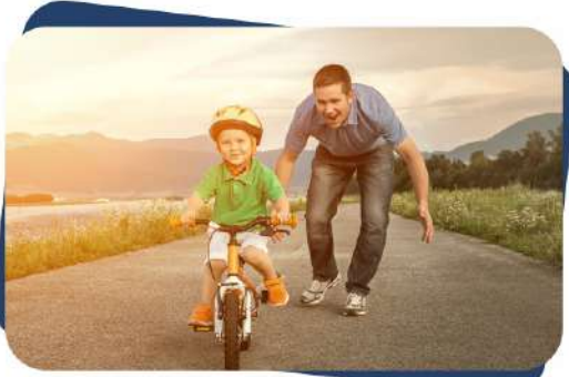
Near to Proposed SIPCOT