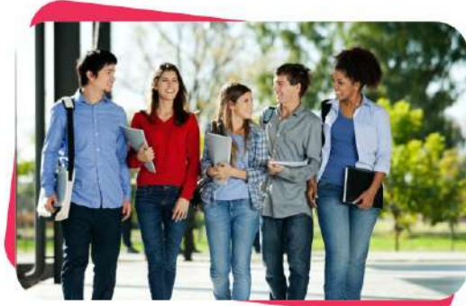
Near to Schools, Colleges, Banks & Govt. Offices