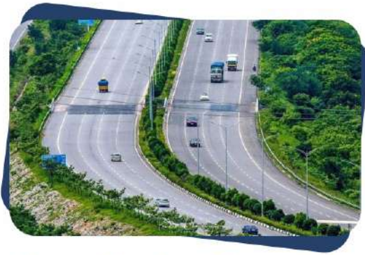
Very Nearby Chetpet to Melmaruvathur Outer Ring Road