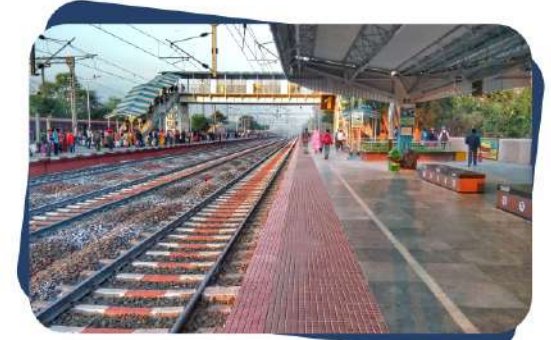
Proposed Vandhavasi Railway Station