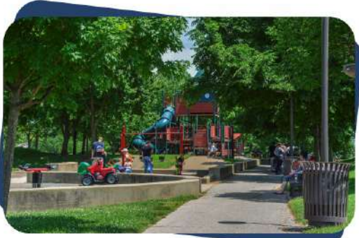
Park & Children's Play Area