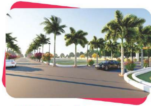
Wide Blacktop Roads (33,30&24 Feet)