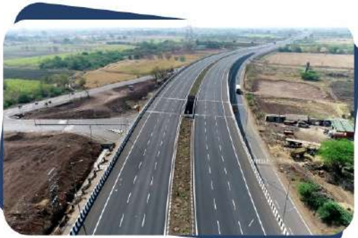
Tindivanam to Vandhavasi Bypass