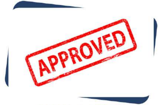
DTCP & RERA Approved Township