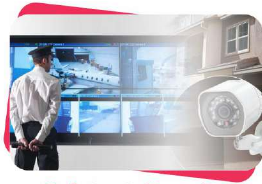
Safety & Security