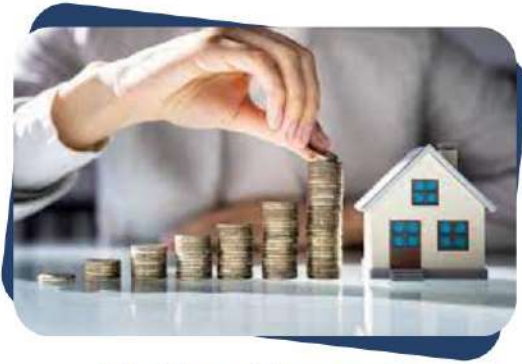
Better Property Value