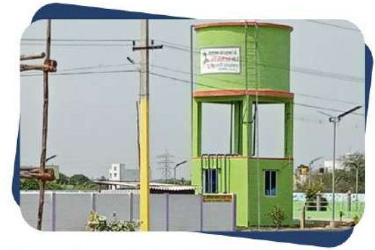
Overhead Tank & Individual Water Pipe Line